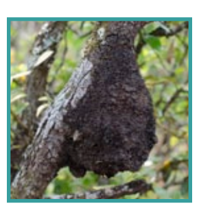
TERMITE NESTS IN WALL CAVITIES, POLES AND TREES

Apply to form a continuous chemical barrier (both vertical and horizontal) around the structure and to a depth reaching to 80 mm below the top of the footings.